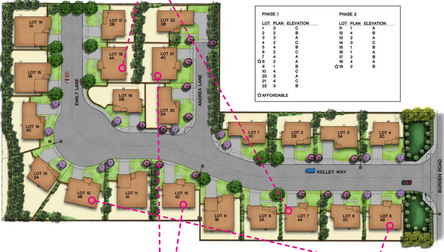
PLAN 4A Lot #18 & #7